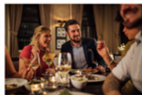
Upscale Restaurants and Bars