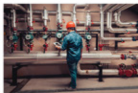
High Noise Industrial, Manufacturing, Production Facilities