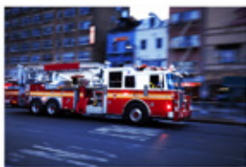
First Responder Facilities